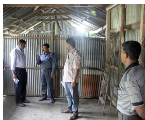
Staff informing about canteen WIP

He also checked the reception and registration point of the hospital. Talked with the responsible personnel and took note. He was happy with the procedure and