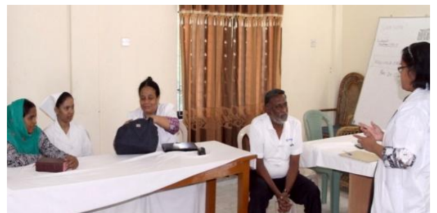
Listening to nurses

He first conducted the morning devotion and later spent the morning hours with the nurses. Heard from them about the working environment and also some other issues. He requests them to be more dedicative and caring. Our nurses also gave him positive feedback and appreciated his concern towards our community. Later at the afternoon on the same day he set for his return journey to Dhaka.