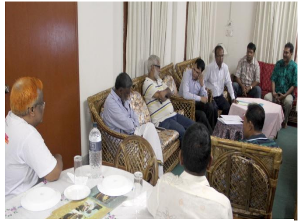
Meeting with local advisory committee