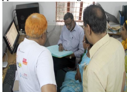
Discussion with accounts head