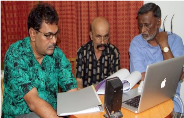
JPOC meeting over Skype