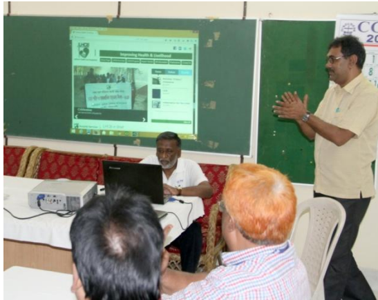
Inaugurating LHC website